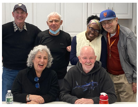
West Orange Members (Pictured from left to right)

Adler Aphasia Center, a non-profit organization with three full service facilities based in Maywood, West Orange, and Toms River, NJ and nine Aphasia Communication Groups located throughout the state, is an innovative program that addresses the long-term needs of people with aphasia and their families. Aphasia is a language disorder that usually results from a brain injury (such as stroke, brain tumor, accident, or infection). While aphasia can affect one's ability to speak, understand, read and write, it does not affect intellect. For more information about our programs and services in Maywood, West Orange, or Toms River, NJ, or for information about our Aphasia Communication Groups in Bridgewater, Haddonfield, Hammonton, Maywood, Monroe, Scotch Plains, Toms River and Virtual NJ Group, visit our website at www.adleraphasiacenter.org or call 201.368.8585.