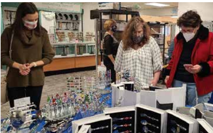
Something Special shoppers supporting the Center

13 We made remarkable efforts to reach our donors and friends via social media and virtual events in