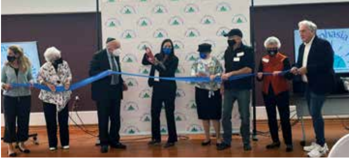
West Orange ribbon cutting

10 We opened our West Orange program in a new location in the fall at Temple B'nai Shalom and welcomed more than 100 community leaders, donors, Center families and special guests to an Open House and ribbon cutting ceremony. Original Saturday Night Live writer, screenwriter and best-selling author whose family member was a former West Orange member, Alan Zweibel, was our featured speaker.