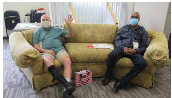
Members socializing at the Center while social distancing