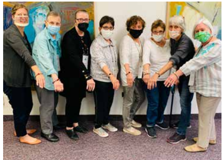
Caregivers display their Something Special bracelets.

6 Having offered 10 monthly virtual and in person caregiver groups, 90% of caregivers surveyed in 2021 reported that their own lives had improved as participants of our formal Caregiver Support Groups.