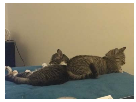
Sherlock and Wendell