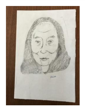
(I drew his picture by looking at his photo on the cover of the Time Magazine.)

The beautiful in the eyes and the smile of the lips is absolutely kind and compassion. The fact is that an old man. The man's robe lies nothing important.