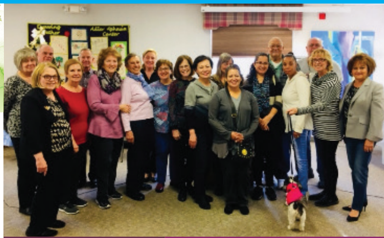
▲ Each year, we acknowledge our caregivers by holding a very special Caregiver Appreciation Day to recognize and honor all of our caregivers. This group of special people, some pictured above, are like an invisible army who deserve all the support we can give them for the critical roles they play in helping their loved ones hold on to their independence.