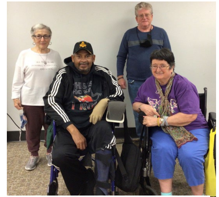
Maywood ACG Members