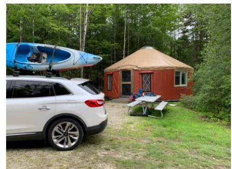
24 foot yurt

We experience a whole other dimension of summer by traveling to Maine each summer since 2003. We stay at the Navy's Great Pond Outdoor Adventure Center near Aurora, Maine for a week each summer. We stay in a 24 foot yurt. The yurt is a domed wood frame structure with canvas stretched over it. It resembles a huge igloo. We used to tent camp, but it always rained, and we could never dry out. We get to kayak and swim in the lake and listen to coyotes howl at night as we sit by the campfire.