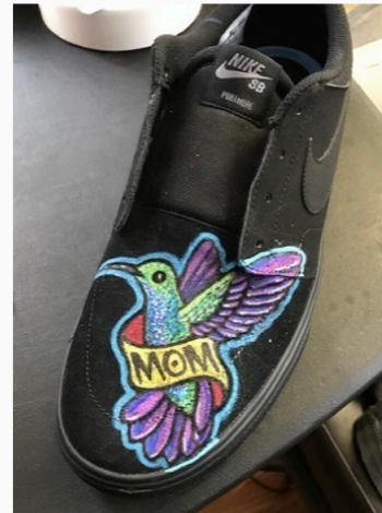
The sneaker, too.