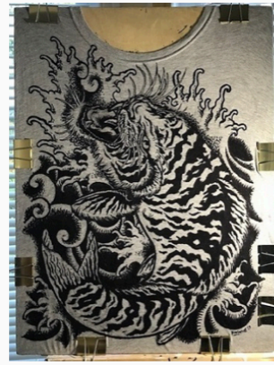
The aphasia t-shirts, I did two weeks ago. The tiger-head fish, this weekend. With my left hand!