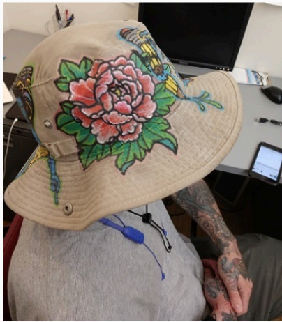
The hat I have on, a couple of months ago.