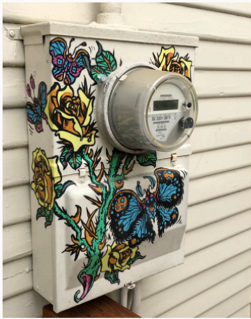
The electric meter was before my stroke. The others are new.